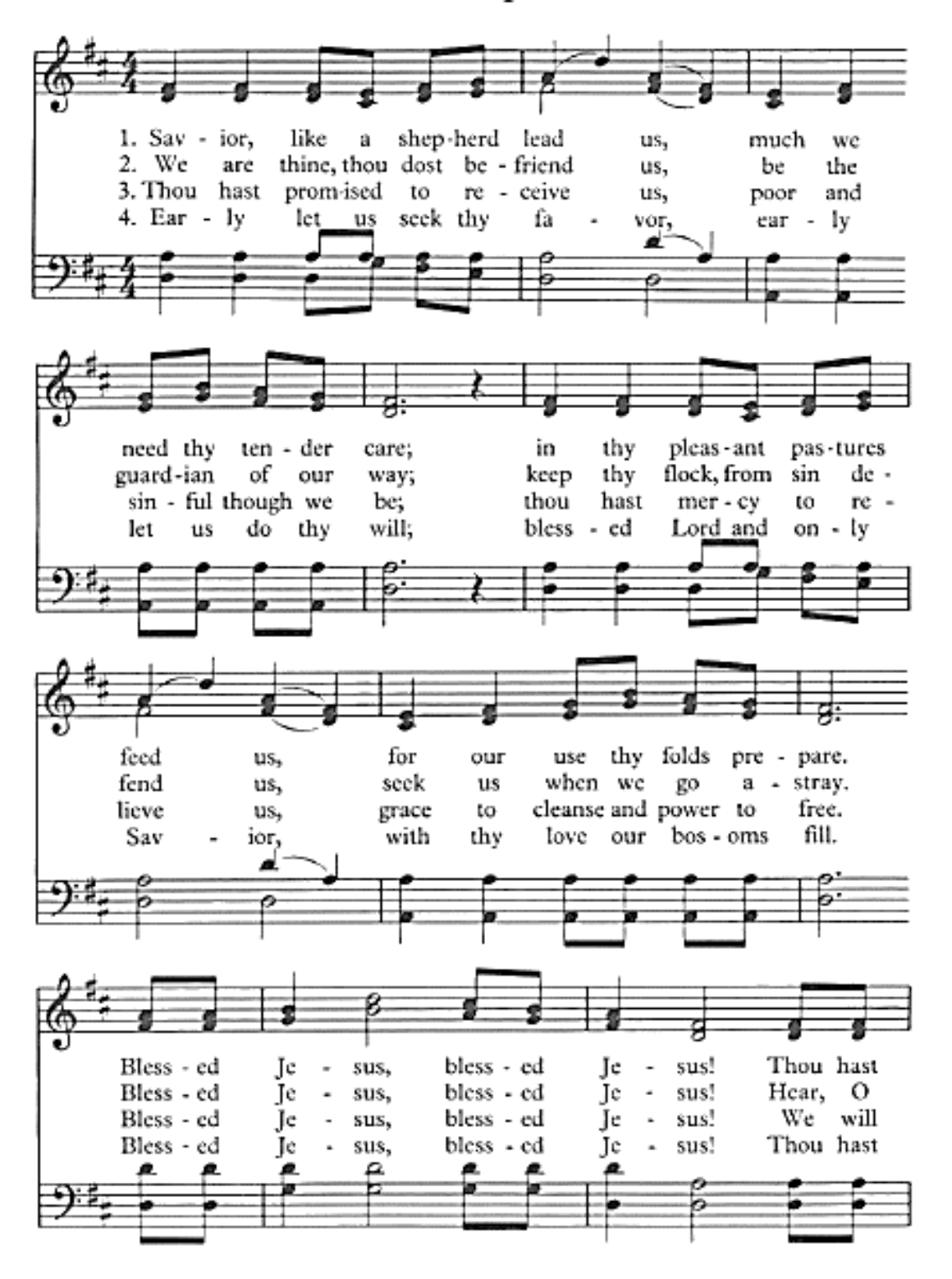
WORDS: Altr. to Dorothy A. Thrupp, 1836 (Jn. 10:1-29) MUSIC: William B. Bradbury, 1859